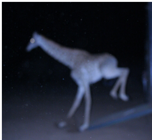
Watch us in this place!

After four unsuccessful attempts earlier this month, our four new giraffes were released on Zandspruit last Monday (July 28). One of the giraffe turned out to be a young male, but to avoid causing it additional stress we decided to keep him. One of the three females is pregnant.