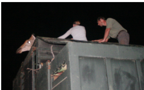
It was very dark, we did our best but the pictures are still a bit out of focus.