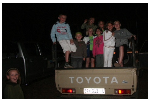
And watch us having fun in this place!!!