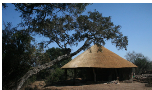
The main building

There is also a swimming pool to cool down in and for the kids to play in.