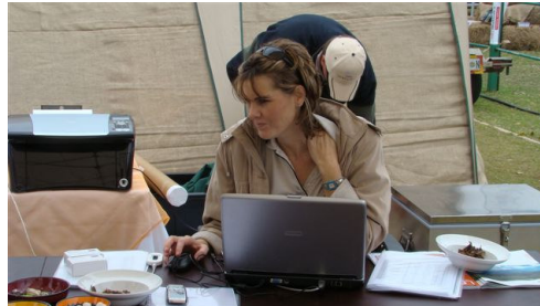
Stand at the Wildsfees

Although it was very cold and the number of people that visited the festival was less than usual, there was a lot of interest shown in the Zandspruit development.