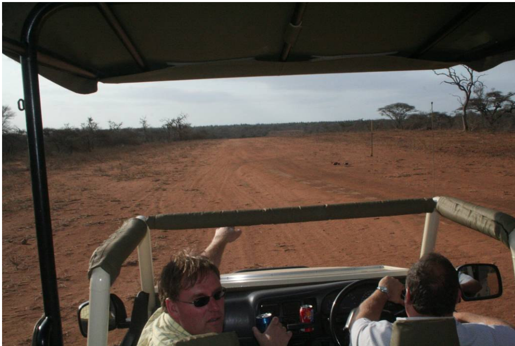
Airstrip and roads cleared

We have planted 80 Marula trees down the southern side of the R527 to create a lane of Marula's for the future generations to enjoy. This was done for two reasons, firstly we are trying to create a good look and feel to the Estate, even when just driving past and secondly, we had to remove a few trees on the enlarged airstrip and wanted to replace these 10 fold.