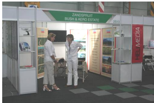
Our stand at the trade fair

We picked up many contacts from interested parties, both local and from abroad, which we are following up on a regular basis. Here, the advantage of having an overseas Director that can deal with all the enquiries from Europe, becomes obvious. The biggest challenge is to get the potential clients to Hoedspruit. From there, we believe, the Estate will sell itself!