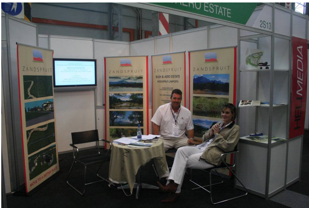
At the end of a long but rewarding day