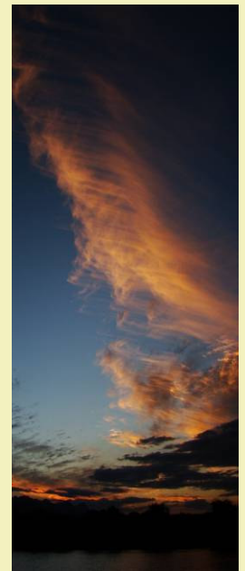
Bush Camp Boma