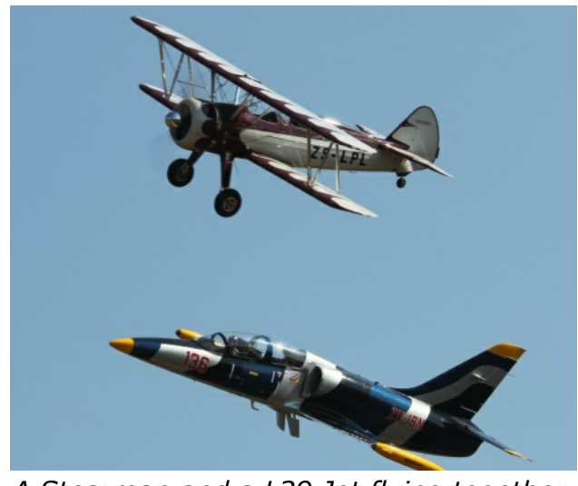
A Stearman and a L29 Jet flying together. "This is a very unique formation, exclusive to Zandspruit" - Pierre Gouws